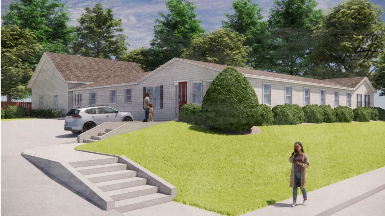
Figure 1 Rendering of New Exterior of Family Center

unification and beyond, learn more about their initiatives at www.friendsofpyf.org or by following Friends of Pals, Youth and Families on Facebook or LinkedIn.