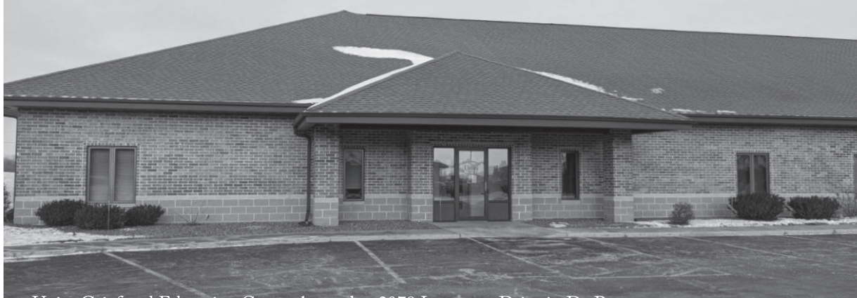
Unity Grief and Education Center, located at 2079 Lawrence Drive in De Pere.