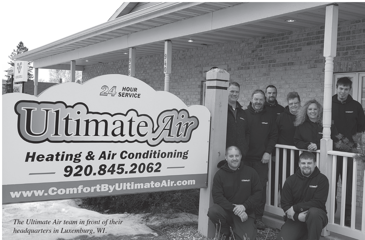
The Ultimate Air team in front of their headquarters in Luxemburg, WI.

Air quality should be at the front of everyone's mind, especially when indoors. Ultimate Air, Inc., specializes in providing first-class air quality and heating and cooling systems. The company's goal is to help families live a more comfortable, healthy, and safe life within their homes.